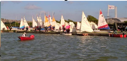
Cadets at Piddinghoe