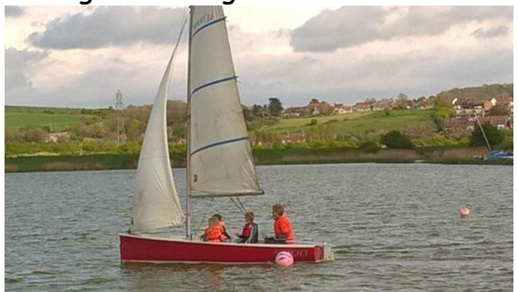
Sailing at Piddinghoe